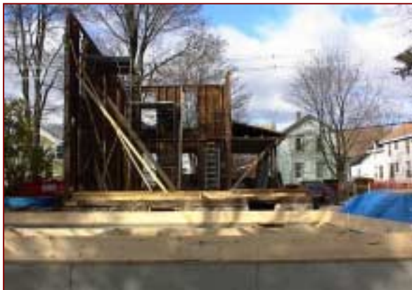
Photo: Little original structure survived! (Rear view) October, 2000.

June 2002 —Reunion weekend dedication ceremony and opening.