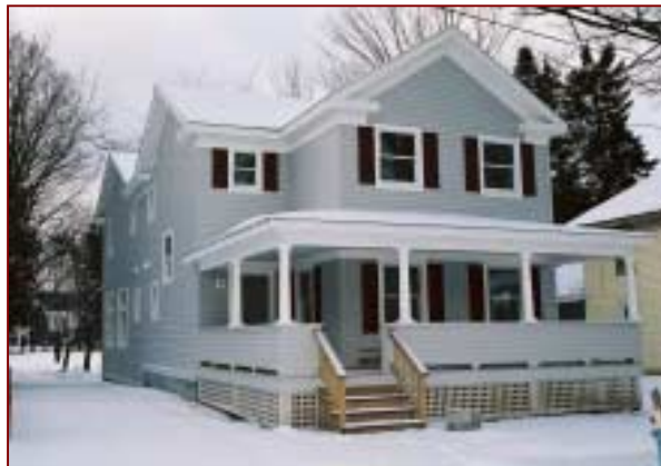
Photo: Exterior reconstruction complete. February 2002.

Welcome to... Thirteen House 13 College Street Hamilton, NY 13346